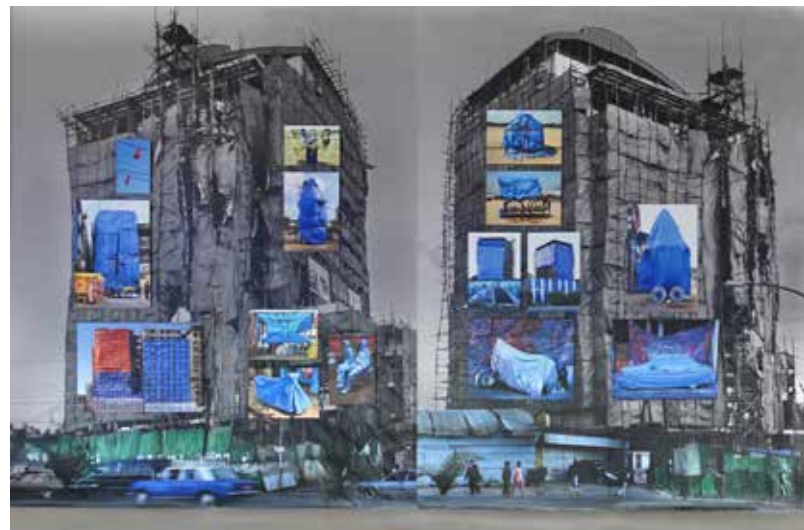
DEIDI VON SCHAEWEN: Wrapped City , 2019, installation view of the exhibition

The “Sidewalks” reflect an image of “life from above”: with their crushed cans, they remind us of César’s compressions; the wrapped buildings remind us of Christo’s work, but without his intervention... This art brut, the true object of her quest, can appear on any street corner: from Bombay to Cairo, from South Africa to China, to India, which she has often explored.