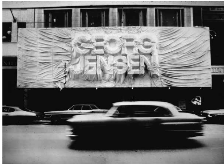
DEIDI VON SCHAEWEN for HERB LUBALIN: Construction barricade, 1972

„With her alert eye, the quick reflexes, ready to surprise what moves in the universe of the inanimate, she collects the neglected signs of an urban scenography, its precarious lifestyles, the impromptu sequences that form a coherent set of captivating images.“